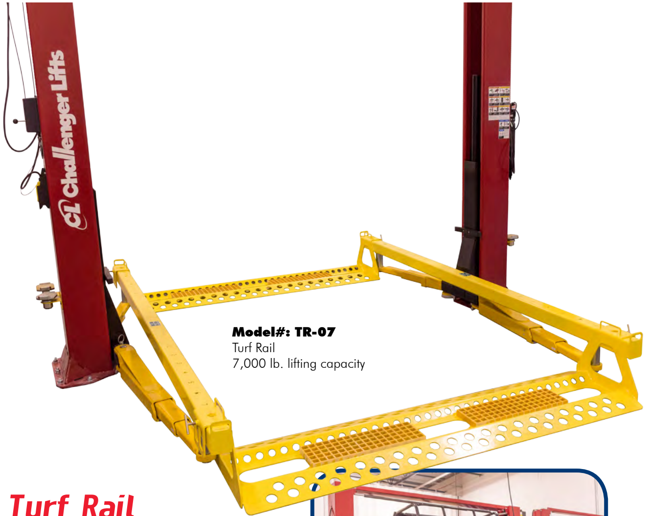
Model#: TR-07 Turf Rail 7,000 lb. lifting capacity