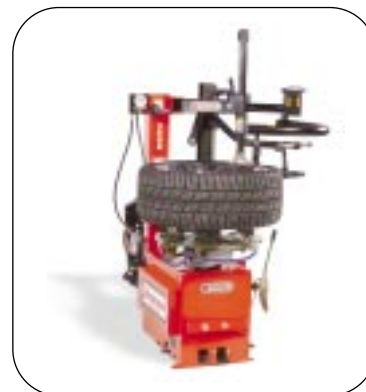
Capable of changing rim diameter up to 31" with optional adapters