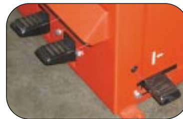
Less confusing, bead breaker pedal on side of machine activates a 2 position bead breaker