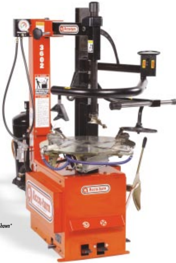
Model 3602HP Shown*